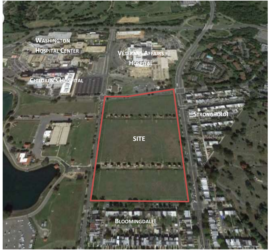
Aerial Showing McMillan Site and Surrounding Area

The McMillan PUD site is divided into seven parcels and the subject of this application, Parcel 2, is located along First Street to the west, the North Service Court to the north; Half Street and Parcel 3 to the east; and Parcel 5 (approved for townhouses) to the south. Three Quarter Street, a private street, bisects the property in a north to south direction. The squared shaped Parcel 2 has a land area of approximately 1.53 acres (66,654 square feet) and slopes gently from Half Street up to First Street.