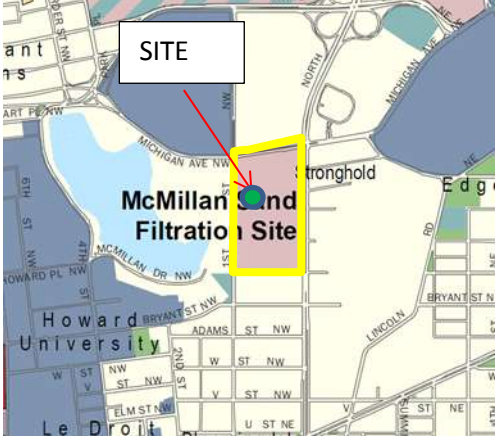
Future Land Use Map